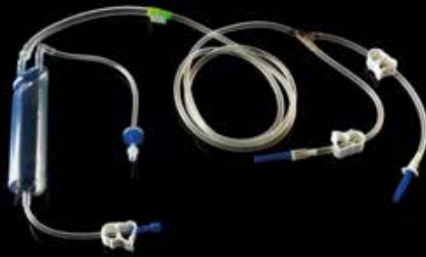
Day Set AV4503