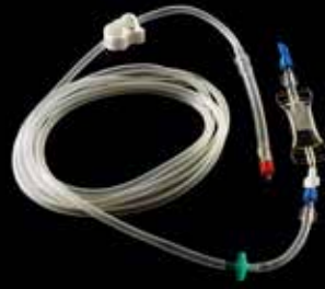
Patient Set or Intermediary Set AV1102