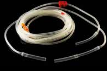
Patient Set AV4509